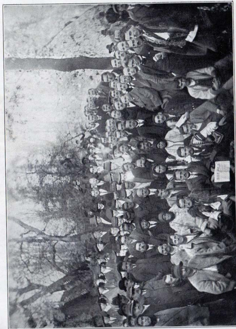
The Annual Congress of the Socialist Party of Carpathian Russia at Uzhorod (November, 1924).